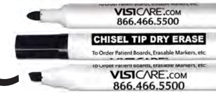
Round or Chisel Tip Markers