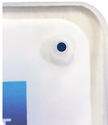
Pre-Drilled Recessed Holes