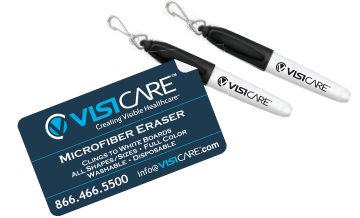
Right to Left: Microfiber Cling Erasers Mini Badge Clip Markers

To order standard VisiCare™ markers, erasers or to customize them with your logo: Call 281.465.0040 Email orders@visicare.com Order Online visicare.com